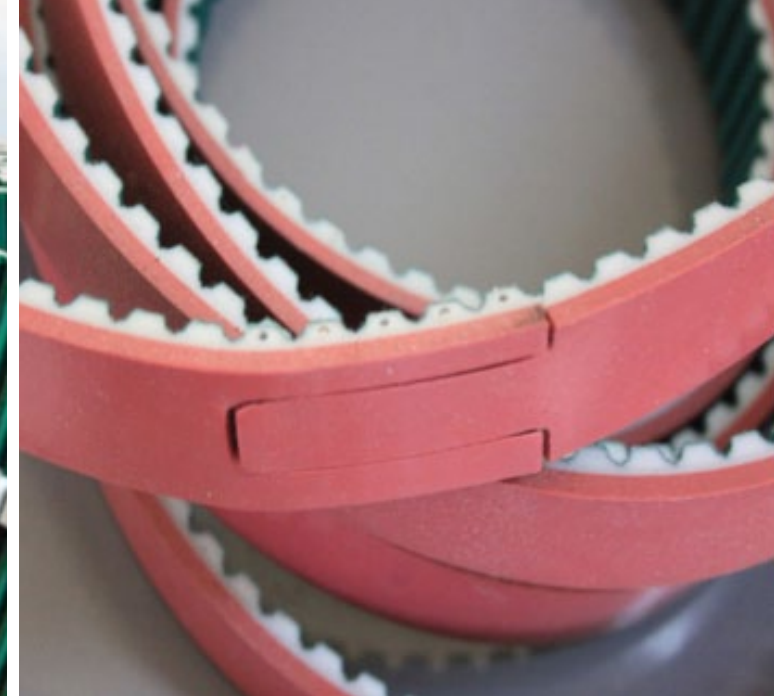
Pin joints on available on all standard polyurethane type timing belts.