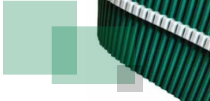
PAZ covered timing belt with centre tracking rib.