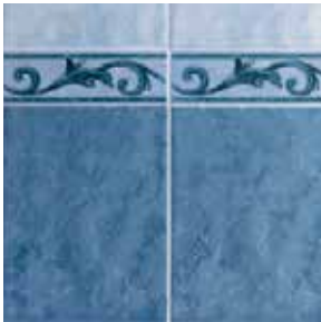
Printing flaws due to irregular belt feed